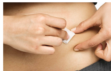
Clean using a circular motion